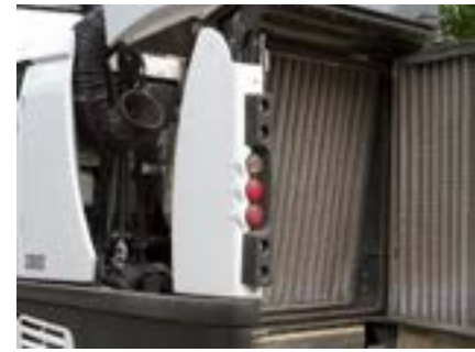
ABOVE CR100 Internal Fan & Airflow