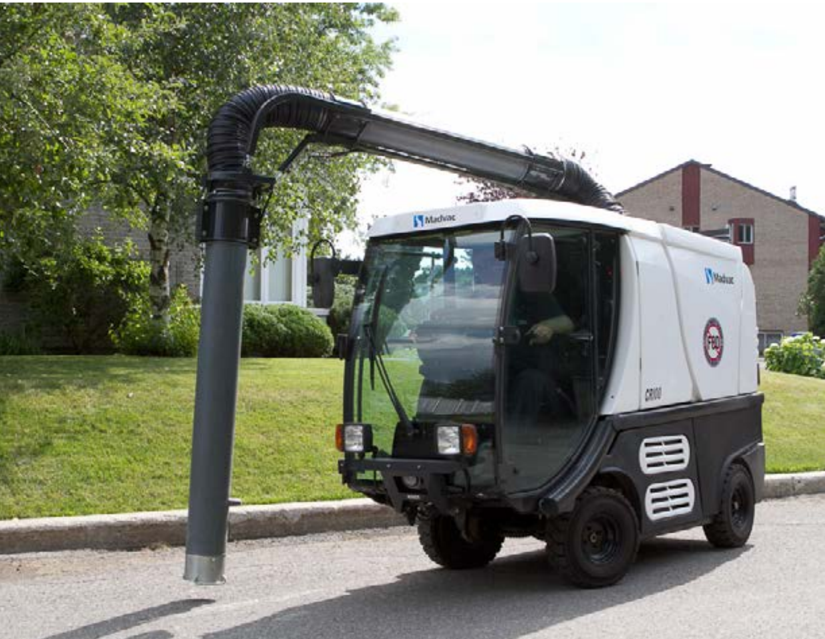
Madvac ® CR100 – Compact Vacuum Robotic Arm with High Dump