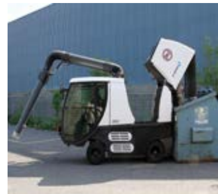
BELOW Stainless steel hopper gives 60" dumping height